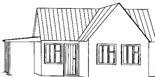
Fig. 1. Diagram of a green house

Text text text text text text text text text text text text text text text text (Table 1).